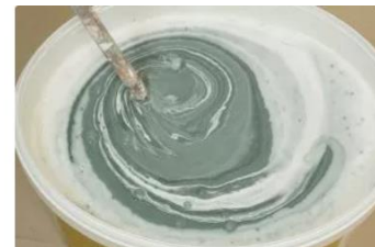
6. Using the stirrer, stir the pigment mixture evenly into the paint.