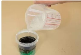
2. Add water – about half of the weight of the pigment (e.g. 500 ml of water to 1 kg of pigments).