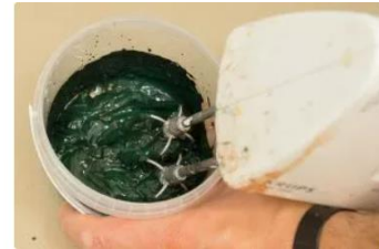
3. Mix the pigments using a hand mixer or a wooden stirrer, until the pigment mixture is smooth and thick.