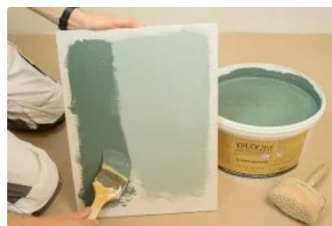
8. Paints and plasters are considerably darker when wet and become brighter as they dry.

This is an example of exactly the same paint, freshly applied on the left and fully dried on the right.