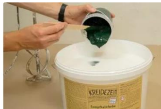
5. Add the pigment mixture to the paint.