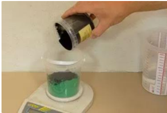
1. Weigh the pigments.