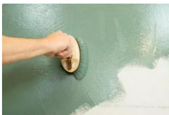
7. Apply the paint and leave to dry.